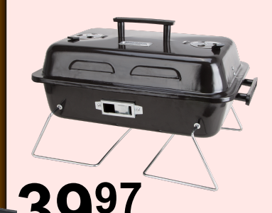
Table Top Charcoal Grill

168 sq. inch cooking area. Sturdy steel construction Porcelain enamel finish.